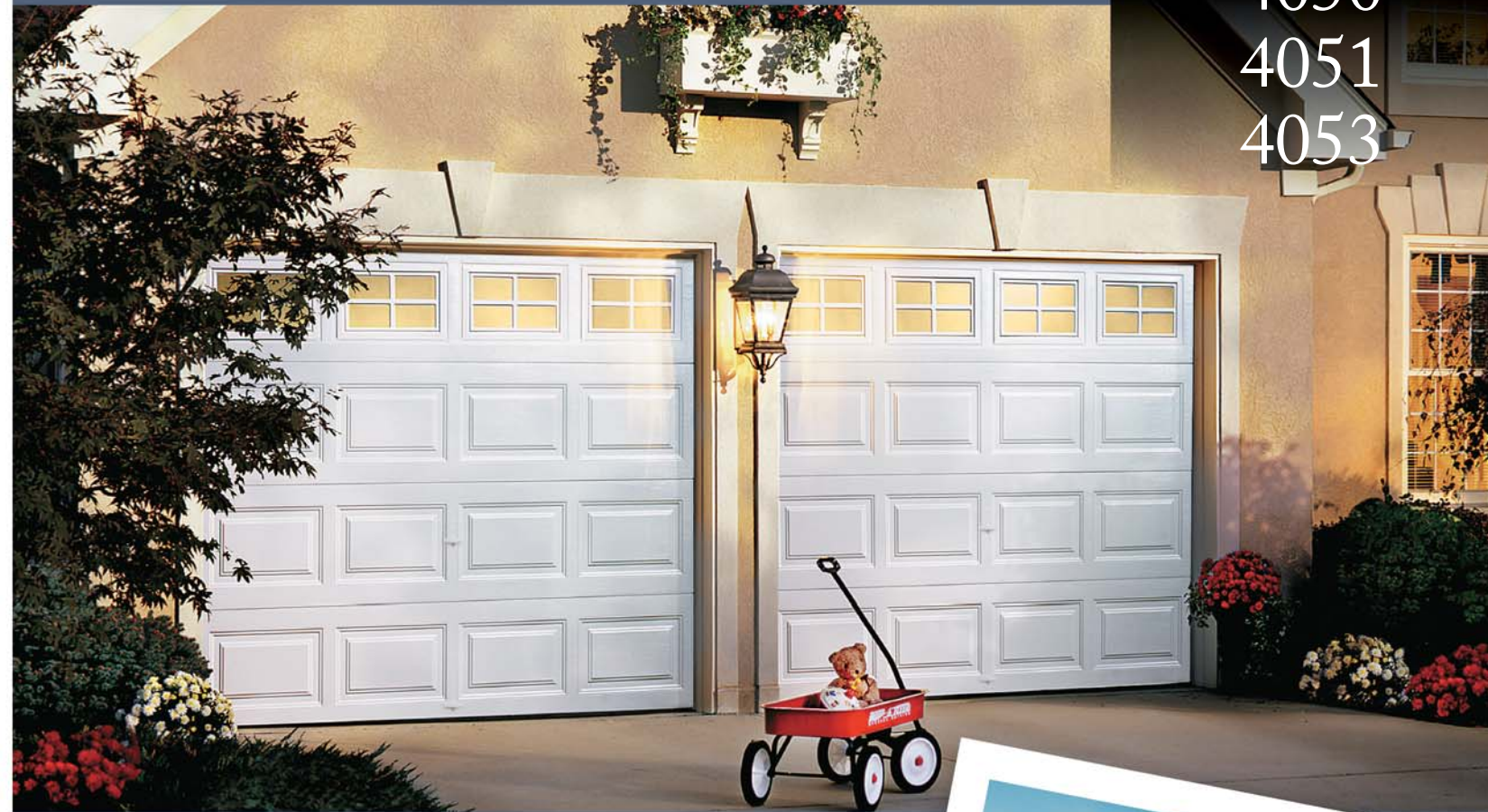
Model 4050 Short Elegant Panel with Optional Colonial 509 Window Design

With a three-layer construction and three beautiful panel designs in six color options, the Models 4050, 4051, and 4053 Series doors are the right choice for your home's design. The Premium Series' three-layer construction provides exceptional strength, insulation, dent resistance and security, as well as uncommonly quiet operation and a beautiful appearance outside and inside. No other manufacturer offers more styles, colors and windows than Clopay.