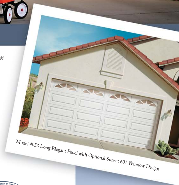
Model 4053 Long Elegant Panel with Optional Sunset 601 Window Design

With a three-layer construction and three beautiful panel designs in six color options, the Models 4050, 4051, and 4053 Series doors are the right choice for your home's design. The Premium Series' three-layer construction provides exceptional strength, insulation, dent resistance and security, as well as uncommonly quiet operation and a beautiful appearance outside and inside. No other manufacturer offers more styles, colors and windows than Clopay.