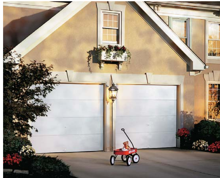
Model 4051 Flush Panel Woodgrain Design