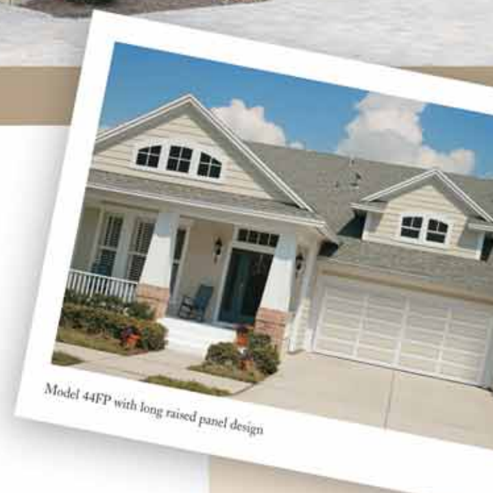
Model 44FP with long raised panel design