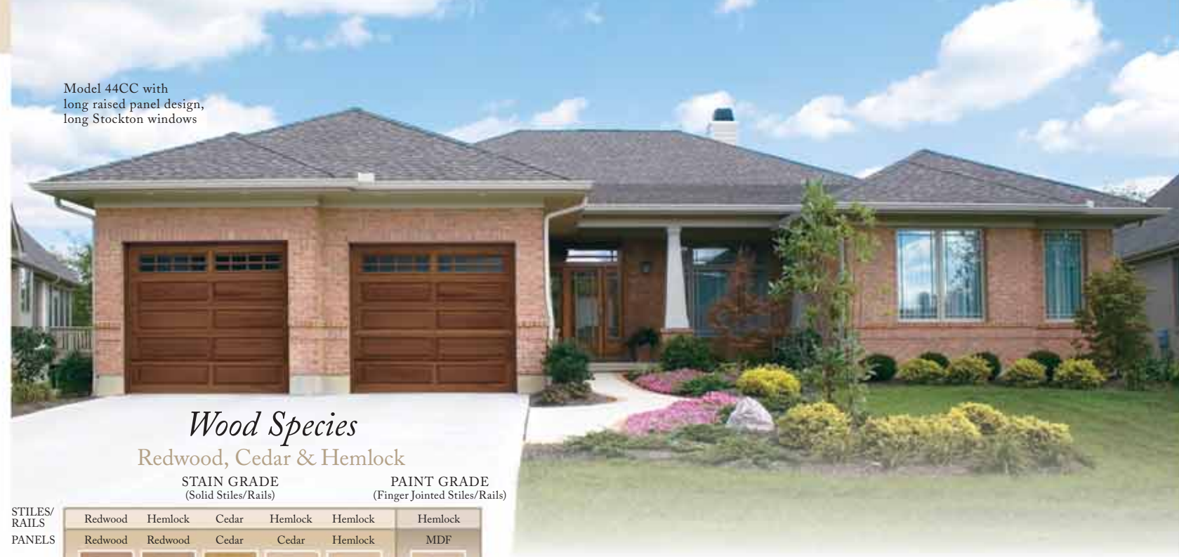
Model 44CC with long raised panel design, long Stockton windows

Additional height/panel configuration options are available on opposite page.