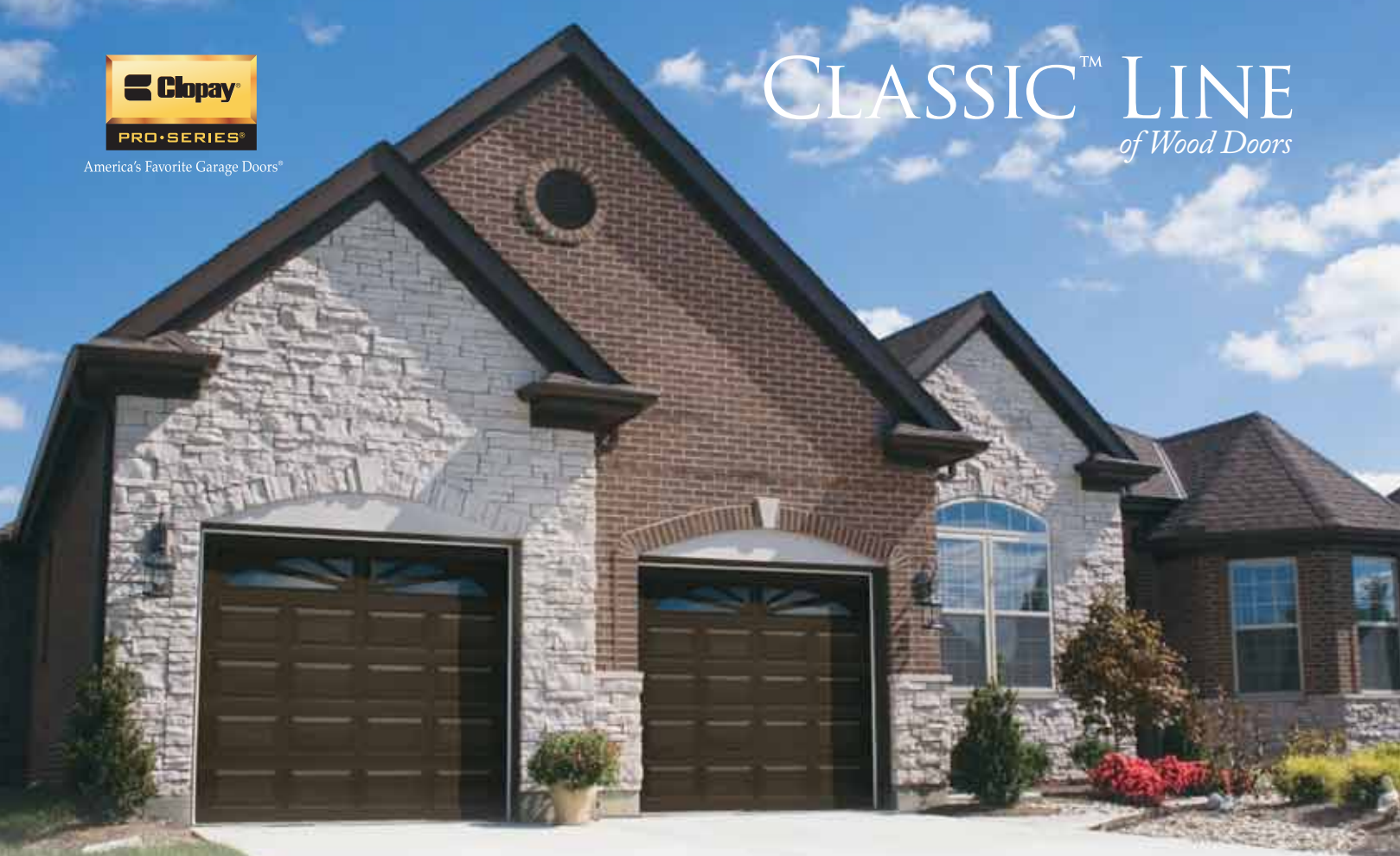
Model 44HH with short raised panel design, long Horizon windows