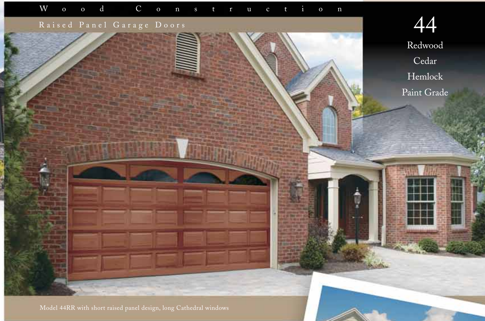
Model 44RR with short raised panel design, long Cathedral windows

Get the look you want and the ease of operation you require