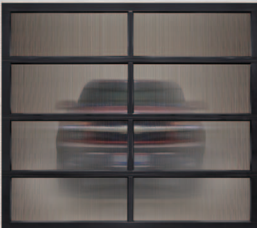
Available with polycarbonate glazing.

Both standard exterior and "partitioned" interior applications requiring high light transmission and visibility are satisfied by using the durable and attractive Model 902.